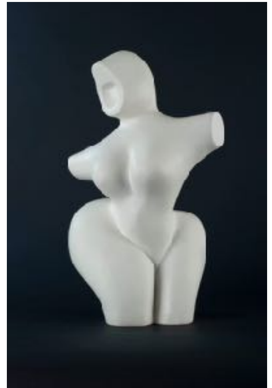
“Lady” by Alison Hooper

“Lady,” a sculpture by Alison Hooper , has been accepted into a juried show at the Watchung Arts Center. The show, which opened with a reception on Feb. 5, will run through the end of February. Although only 13 inches tall, the cast plaster sculpture portrays a sense of scale reminiscent of traditionally carved Italian marble. "Lady" is a celebration of the physical, as well as spiritual, beauty of of all women.