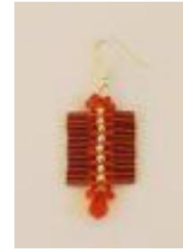
Earrings sold by Helena Axelrod at the holiday boutique included (L to R) ones made from ribbon, handmade paper, and stitched glass.

John Howlett sold “The Sentinel,” a photograph featuring one of the iconic trees at the top of the hill in Watching Reservation, totally covered in snow.